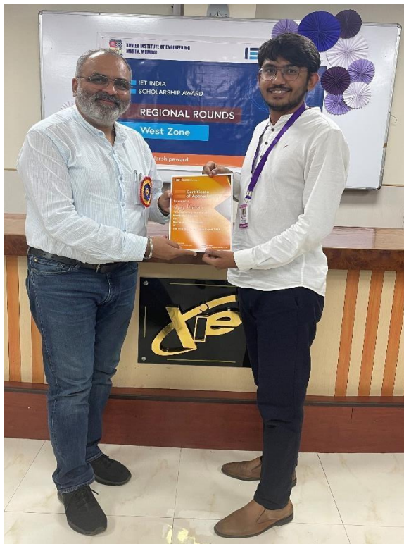
Appreciation of XIE On Campus Committee Members