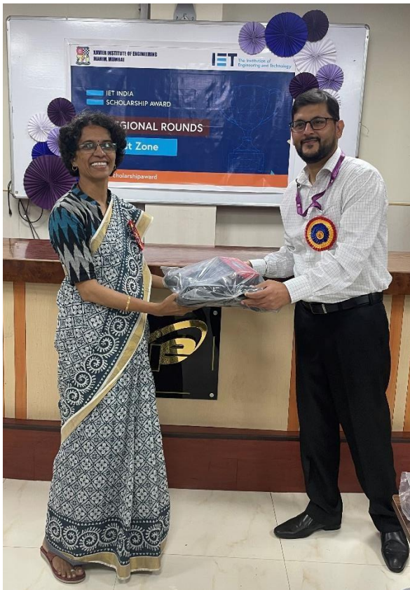
Appreciation of Jury