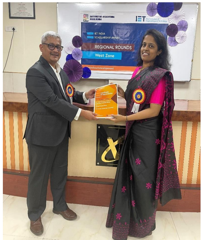
Appreciation of IET Organizing Team