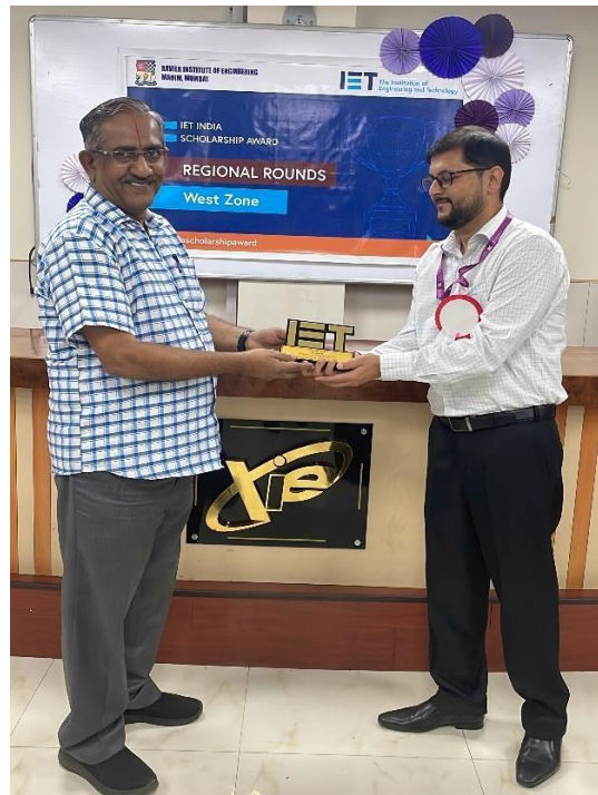
Appreciation of XIE by IET India