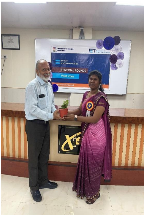
Felicitation of IET Members