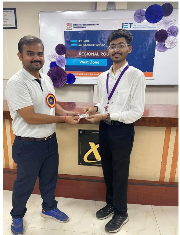
Felicitation of XIE On Campus Committee Members