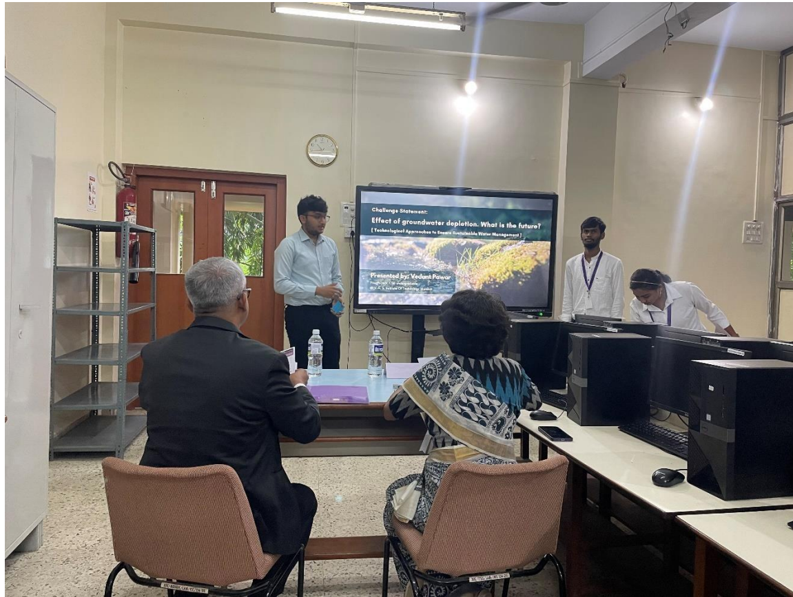
Participants presenting in front of jury